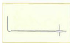
Gas flow velocity measurement with m/s, absolute pressure sensor and different pitot tubes