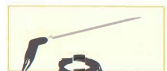
Probes and hoses. MRU offers a wide range of standard (up to 650°C/1,202°F) and industrial probes (up to 1,100°C/2,012°F) with various lengths