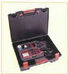
ABS transport case including infrared high speed printer